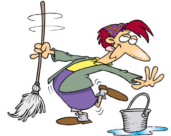
She did get the mop.