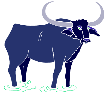
Ox can help .