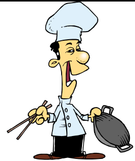
I use a big pan.